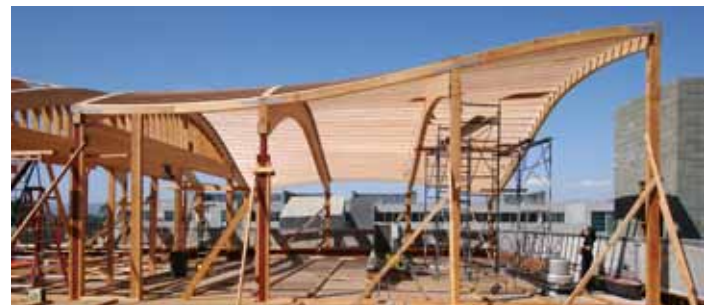
Each CNC-fabricated rafter was custom cut and notched for its specific location in the roof structure. No two were alike.

“The architects at Eric Owen Moss transferred their 3-D models as Rhino files to Structurlam,” said Kris Spickler with Structurlam Products. “We fed them into our CADWorks software to confirm the dimensions, and then sent the data to the CNC machine. The approach takes more up-front work from the architect and engineer, but results in almost limitless possibilities in terms of the finished beams.”