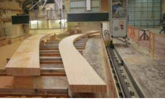
Structurlam Products used a five-axis CNC machine to arch and bevel the huge glulam beams.