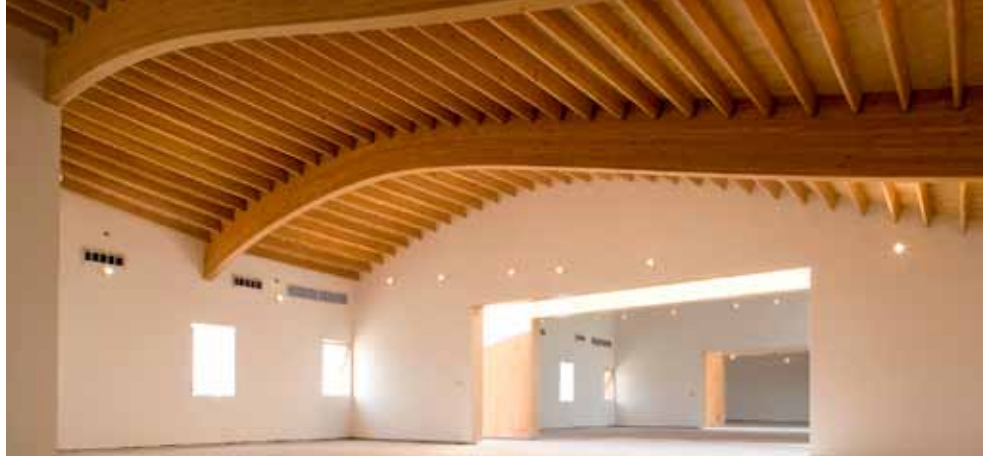
Eric Owen Moss Architects used a sidewall application for lighting and sprinklers to keep the wood roof/ceiling uncluttered.

Spickler added that the commercial construction industry has just scratched the surface of what's possible with wood. "Can we do huge moment connections with wood? Yes. Can we shape beams, make them oval and allow them to form continuous, compound slopes? Yes, of course. Innovative design firms are becoming increasingly aware of wood's potential, and starting to do more creative projects like 3555 Hayden. Architects across North America are really waking up in terms of what they can do with wood."