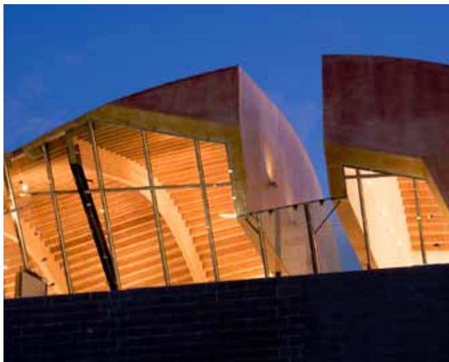
Each beam was laminated to a unique curvature and its top surface beveled to create the undulating roofline.

Ho said the project included its share of engineering challenges. "Our detailing had to complement what the architects wanted, which was a smooth roofline both inside and out,"