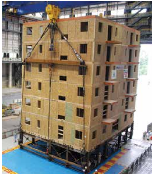
Subjected to three earthquakes on the world's largest shake table in Miki, Japan, this full-scale wood-frame apartment building performed excellently with little damage.

Structural wind-loading requirements are specified in Chapter 16 of the IBC and obtained primarily through reference to ASCE 7-10. The minimum requirements are intended to ensure that every building and structure has sufficient strength to resist these loads without any of its structural elements being stressed beyond material strengths prescribed by the code. The code emphasizes that the loads prescribed in Chapter 16 are minimum loads and, in the vast majority of conditions, the use of these loads in