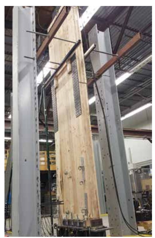
In this rocking test of a CLT shear wall, the panel maintained its lateral load-bearing strength under cycling loading to simulate seismic conditions and returned to a vertical position at completion of the test.

in building code requirements for the wind design of buildings other than tornado shelters. However, it is generally agreed that a building properly designed and constructed for higher wind speeds has a good chance of withstanding winds of weaker tornadoes. Statistically, weaker tornadoes—rated by the National Weather Service as between EF-O and EF-2 on the Fujita Tornado Damage Scale comprise 95 percent of all tornadoes.