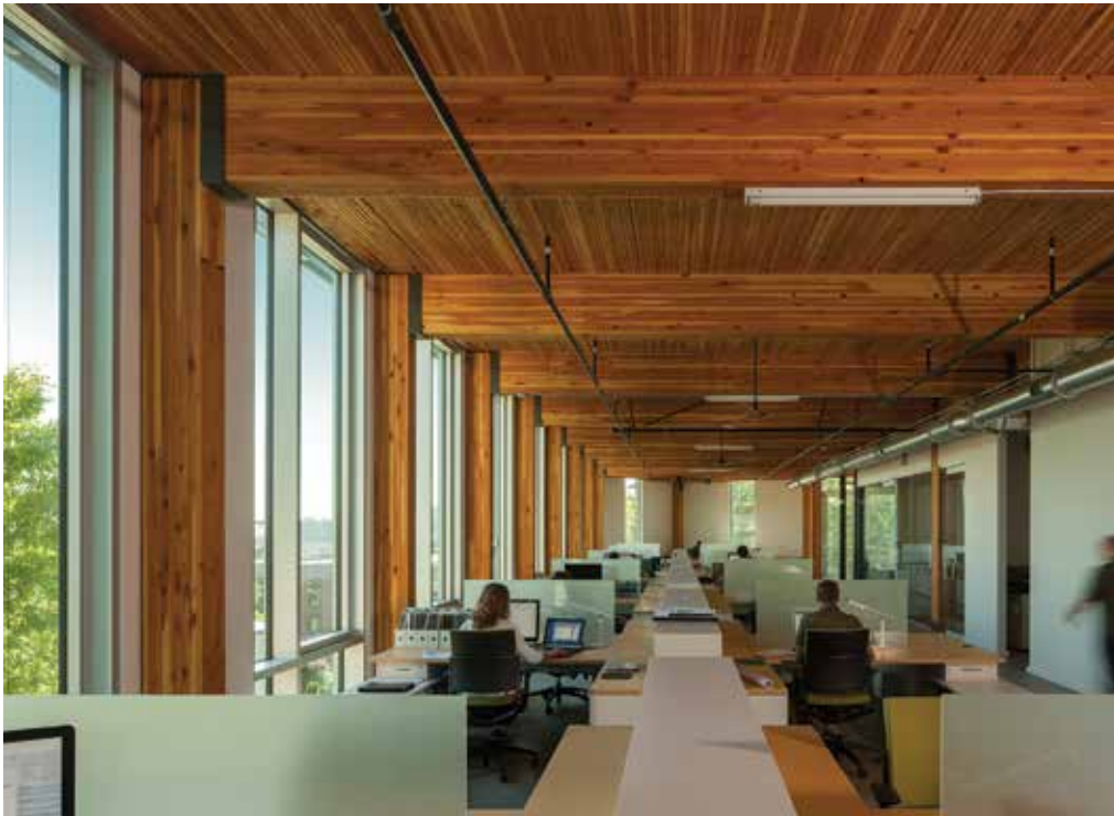
Living Building Certification; The Bullitt Center – Seattle, Washington; Architect: The Miller Hull Partnership; WoodWorks Multi-Story Wood Design Award, 2014.

With growing pressure to reduce the carbon footprint of the built environment, building designers are increasingly being called upon to balance functionality and cost objectives with reduced environmental impact. Wood can help to achieve that balance.