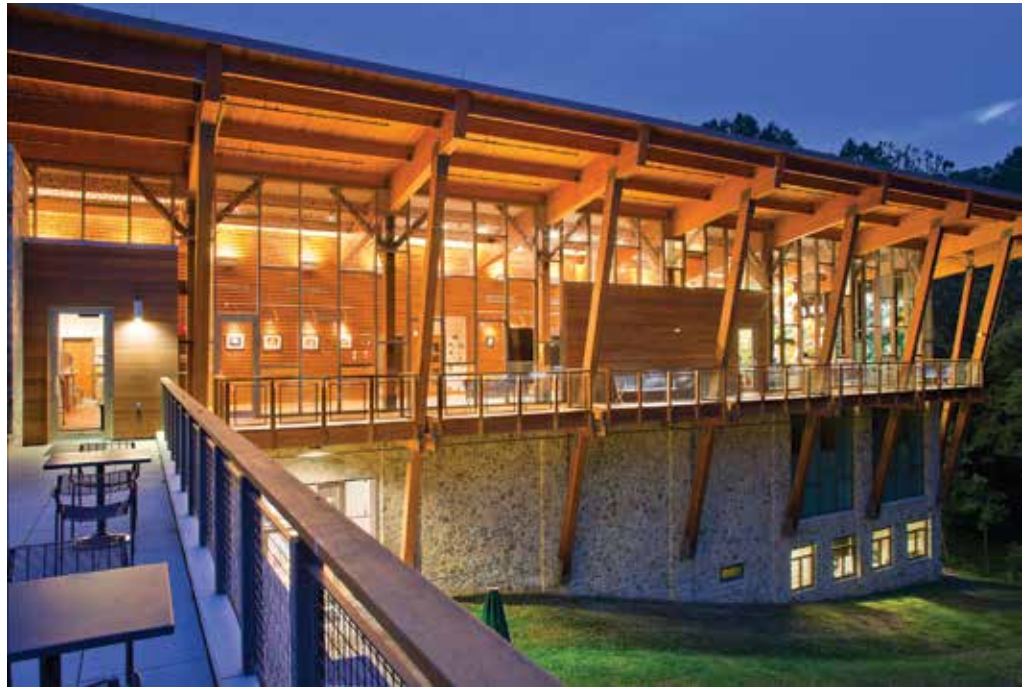
LEED Platinum; James and Anne Robinson Nature Center – Columbia, Maryland; Architect: GWWO, Inc./Architects; WoodWorks Institutional Wood Design Award, 2014.

superior performance, or even consider in building material selection, such things as fossil fuel consumption, global warming potential, total resource use, non-renewable resource consumption, acidification or eutrophication potential, ozone depletion, smog potential, or water use. The reason is that any rating system that does not incorporate LCA or LCA-based tools and information does not have the capacity to consider these things. The same is true of prescriptive pathways within systems that do incorporate LCA and LCA-based tools and information, but do not require their use.