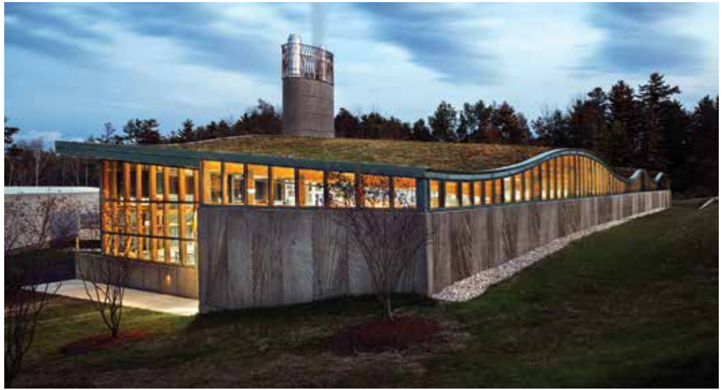
LEED Certified; Biomass Heating Plant, Hotchkiss School – Lakefield, Connecticut; Architect: Centerbrook Architects and Planners WoodWorks Green Building with Wood Design Award, 2014 . Faced with the replacement of an aging fuel oil heating plant, Hotchkiss school chose to build a LEED-certified biomass facility that burns wood chips from sustainably managed forests nearby. Wood was used in the building’s construction and the facility is covered with a rolling, vegetated roof that changes colors with the season.

While green building programs encourage the use of certified wood products, there is no such requirement for rapidly renewable materials or products such as steel, concrete, or plastics.