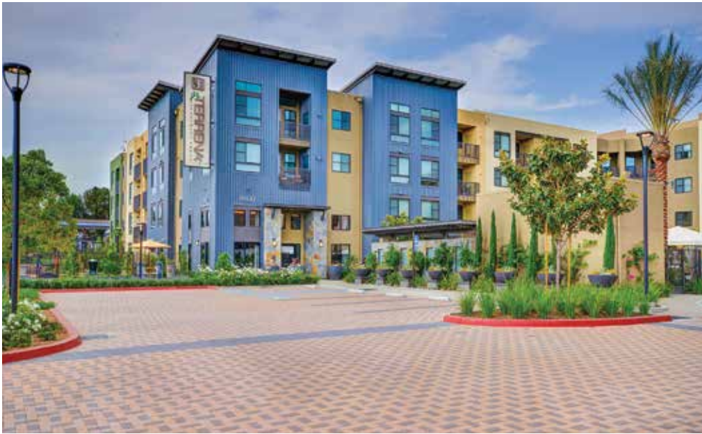
Three Green Globes; Terrena – Northridge, California; Architect: TCA Architects; Developer: Northwestern Mutual Life Insurance Company.

assessment (LCA). The result is greater uniformity between programs and far greater robustness in evaluation, both of which serve to leverage the environmental advantages of wood.