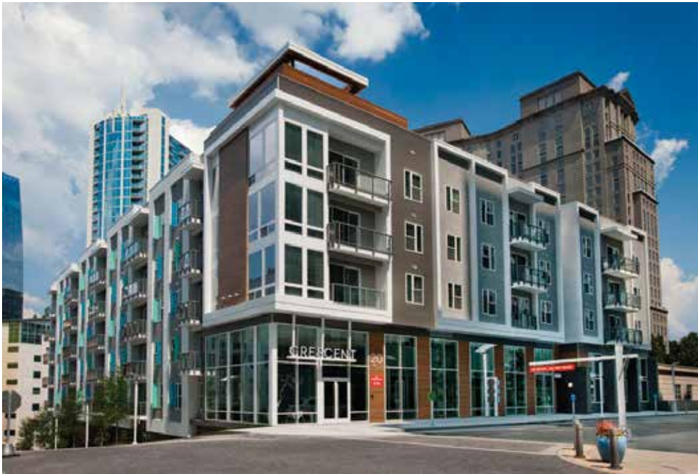
Carbon Benefits: Crescent Terminus – Atlanta, Georgia; Architect: Lord Aeck Sargent. According to the Wood Carbon Calculator for Buildings ( www.woodworks.org), Crescent Terminus has a carbon benefit equivalent to 2,583 cars off the road for a year or the energy to operate a home for 1,149 years.