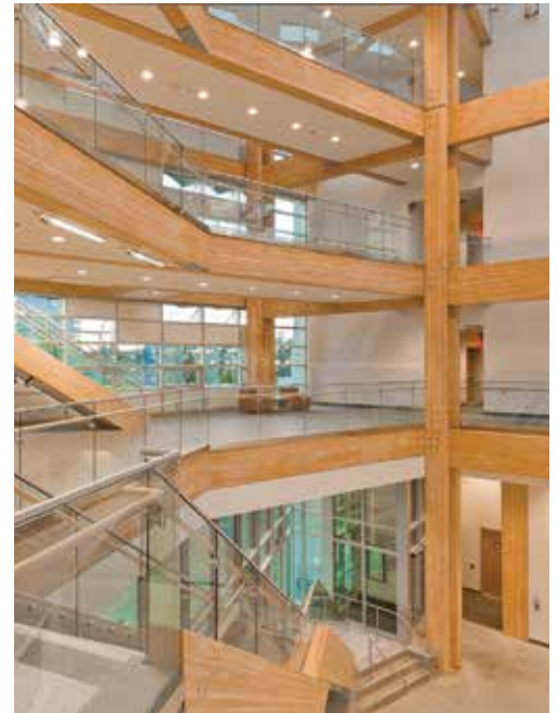
Living Building Challenge; LEED Platinum (in process); Center for Interactive Research on Sustainability, University of British Columbia – Vancouver, Canada; Architect: Perkins+Will. Seeking two of North America’s highest ratings, the building’s moment-frame structure allows for clear-span interior spaces, while its structural deck includes 2x4s sourced from forests affected by the mountain pine beetle infestation.

Indoor air quality. Most rating systems have strict limits on the use of products that contain volatile organic compounds (VOCs). Many wood products are available that verifiably meet or exceed these guidelines.