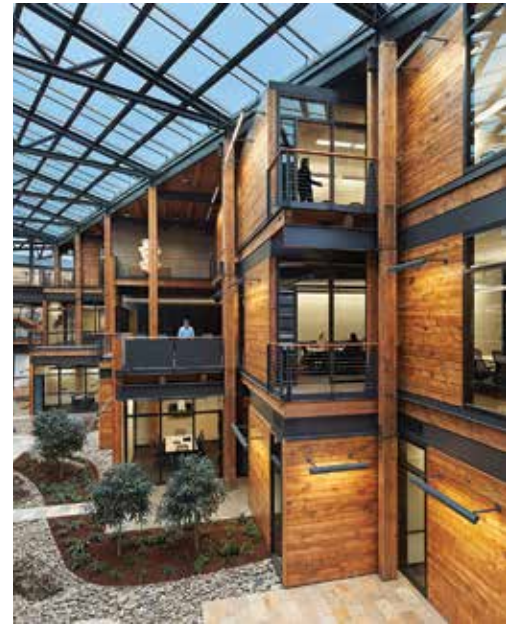
LEED Gold; Federal Center South, Building 1202 – Seattle, Washington; Architect: ZGF Architects; WoodWorks Commercial Wood Design Award, 2014 . All of the wood used in this project was salvaged from a 1940s-era warehouse that previously occupied the site – a total of 200,000 board feet of heavy timber and 100,000 board feet of 2x6 tongue and groove roof decking.

lists of recommended or required measures outlined the path toward environmentally better buildings. Each measure typically addressed a single concern or attribute such as recycled, recycled content, rapidly renewable, and sourcing. Recommendations for improving environmental performance of buildings and construction practices varied among the initiatives, as did recommendations for the use of wood and wood products.