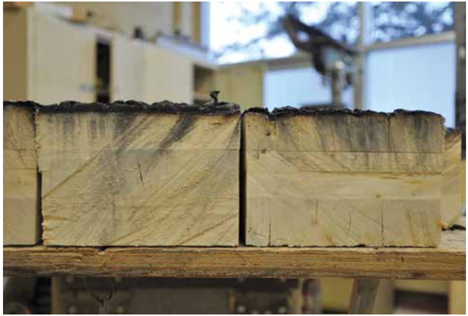
Fire tests show that CLT chars slowly at predictable rates.

By designing a building to meet the provisions of Type III Construction rather than Type V, the designer is able to take advantage of greater allowable heights and areas. For example, fire-retardant-treated