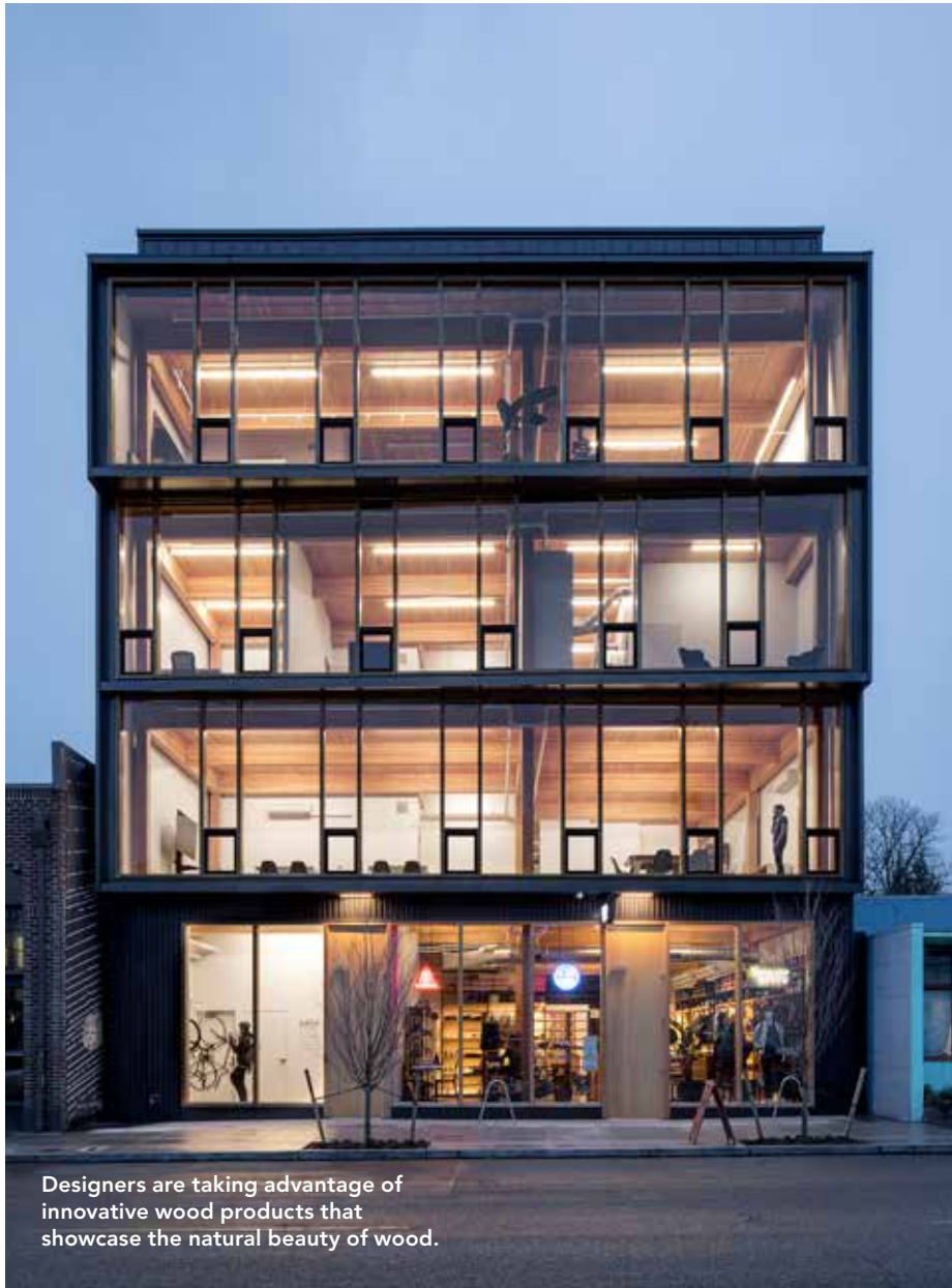
Designers are taking advantage of innovative wood products that showcase the natural beauty of wood.

Using wood in nonresidential buildings is not a completely new idea, but rather a revival. Innovative new construction techniques are expanding the use of lumber; these techniques utilize engineered wood products such as cross-laminated timber (CLT), nail-laminated timber (NLT), dowel-laminated timber (DLT), and structural glued-laminated timber (glulam). These “mass timber” products have great structural capability and inherent fire resistance, and interest in mid- and even high-rise wood buildings that incorporate these technologies