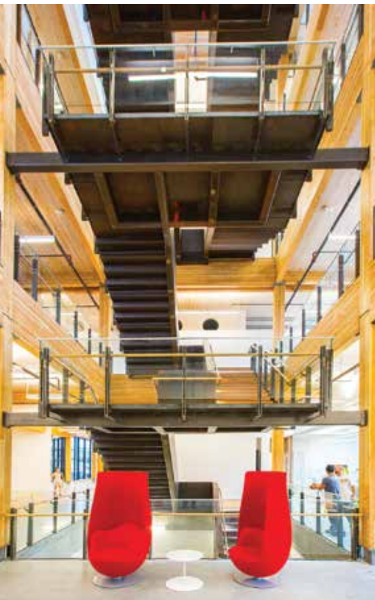
The MEC headquarters building in Vancouver, British Columbia, features an open plan and lots of exposed wood, which contributes to the health and well-being of employees.