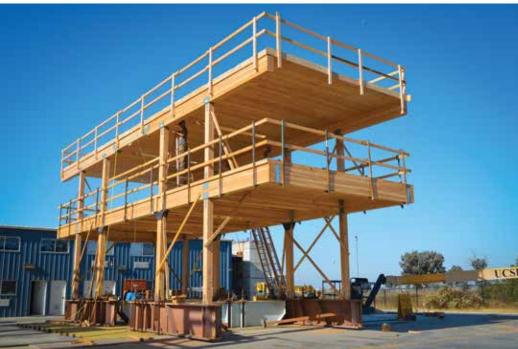
Shake table testing exposes full-scale buildings to simulated seismic events.