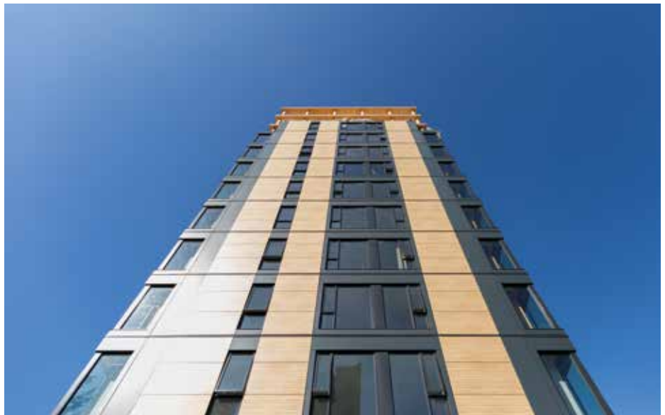
Featuring a hybrid mass-timber system, Brock Commons demonstrates the application of mass timber in high-rise construction.

The most recent example is the International Green Construction Code (IgCC), released in June of 2015. Adopted by 14 states and the District of Columbia, 17 it is the latest phase in an evolution that’s included two American National Standards (covering residential and nonresidential construction), the California Green Building Standards Code (CALGreen), and ASHRAE 189.1, a code intended for commercial green building published by the American Society of Heating, Refrigerating, and Air-Conditioning Engineers (ASHRAE) in cooperation with the Illuminating Engineering Society of North America (IES) and U.S. Green Building