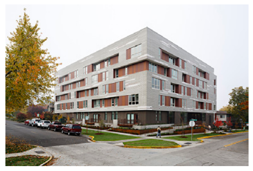
COOL FOR SCHOOL | University House Arena District, Eugene, OR Podium construction can be an efficient and cost-effective way to meet the rapidly growing demand for student housing across the country. This 109,600 square-foot student housing project includes five stories of wood-frame construction over a concrete podium achieving an attractive yet affordable design. ARCHITECT: Mahlum Architects

limits the use of concealed spaces and therefore requires more creativity to meet acoustic goals and conceal utilities.<sup>10</sup>