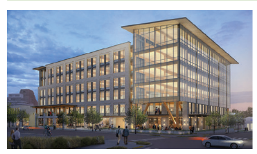
Artist Rendering Courtesy Lake|Flato Architects and BOKA Powell