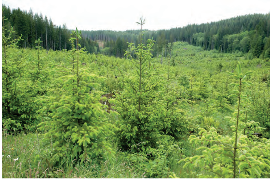
Shown is a Douglas fir working forest in Tillamook County, Oregon.

Through the use of diverse silviculture practices, foresters tend to the forest, ensuring regeneration, growth, and forest health and providing benefits that support a full range of forest values. For example, forest management practices are often selected to mimic natural disturbances and the cycles of nature that are associated with a specific region, forest type, or species. Natural disturbances, including windstorms, hurricanes, ice storms,