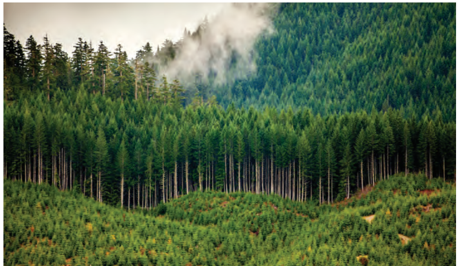
This forest in the northern Sierra Nevada mountains was clearcut to support the natural regeneration of ponderosa pine, Douglas fir, sugar pine, California white fir, and incense cedar.

studies of forest carbon relationships show that a policy of active and responsible forest management is more effective in capturing and storing atmospheric carbon than a policy of hands-off management that precludes periodic harvests and use of wood products. 23