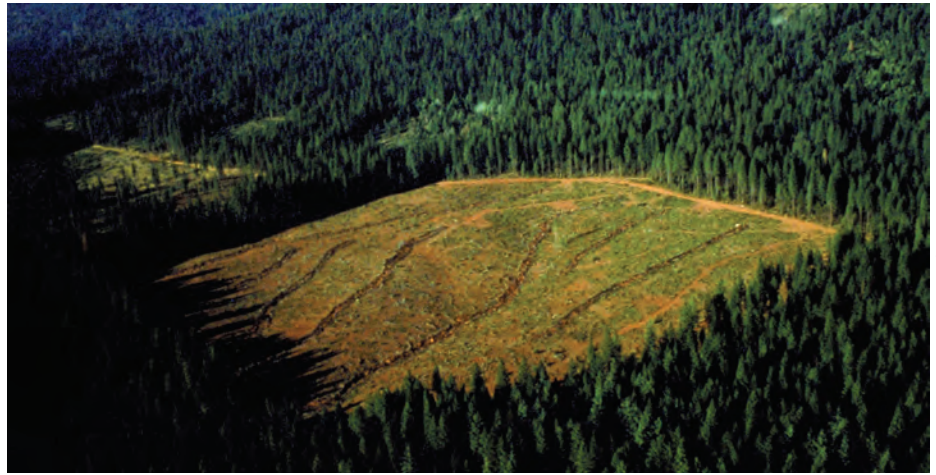
There are different age classes across the forest landscape.

In Canada, bioenergy accounts for 57 percent of the energy used by the entire forest industry. 22 A great deal of research has been undertaken to determine how forests can be managed to maximize their carbon benefits. According to a report from the Society of American Foresters, numerous