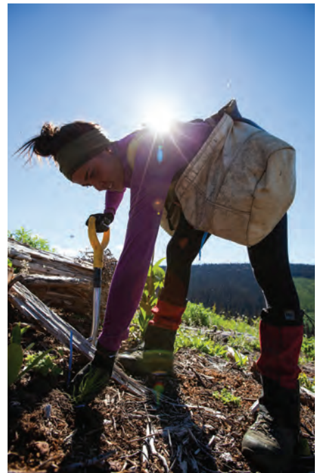
Planting and seeding is a significant component to ensuring healthy forest regeneration.

To control competing vegetation or brush, foresters use a variety of tools including chemical (e.g., herbicides), manual (e.g., saws and axes), and biological (e.g., sheep).